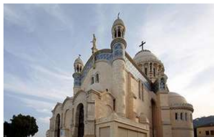
Basilica History adapted from "Origins of Our Lady of Africa," Missionaries of Africa (mafrome.org).

Send corrections and bulletin content to: