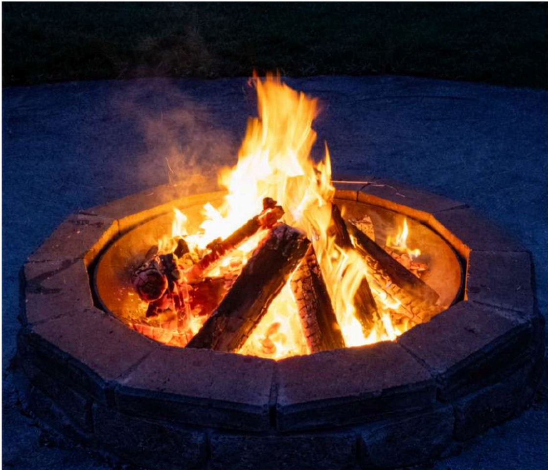
St. John the Baptist Firepit (gallery photo)