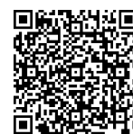
Day of sale volunteer