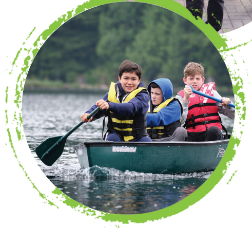
PICTURED FROM TOP: Catholic Youth Convention, Seminarians, CYO Camp