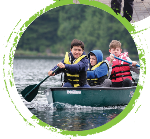
PICTURED FROM TOP: Catholic Youth Convention, Seminarians, CYO Camp