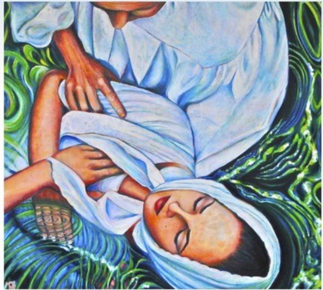
Rappahannock Baptism

Join fellow Catholics and Discerning Deacons as we continue the exciting conversation about this topic raised in the October 2023 synod, including exploration of restoring women as deacons in the Catholic Church.