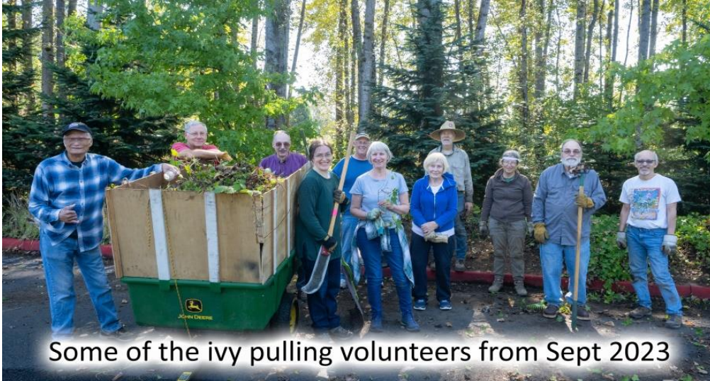
Some of the ivy pulling volunteers from Sept 2023

After the project to clear invasive blackberries & English Ivy last September, a parishioner was inspired to donate a mixture of 130 native bare-root conifer seedlings to St. John's. These will help our forest transition from Cottonwoods & Alders to the gentle giants of a mature evergreen woodland.