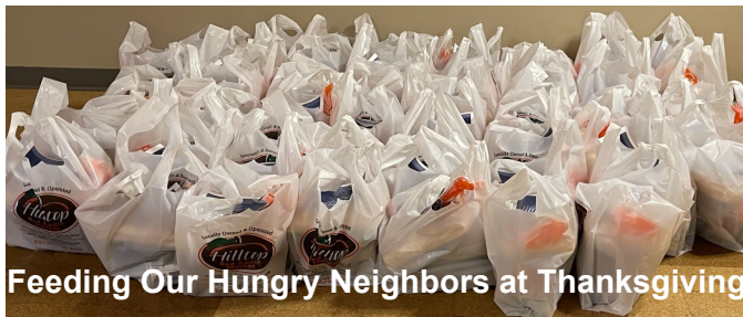
Feeding Our Hungry Neighbors at Thanksgiving