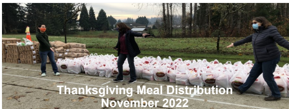
Thanksgiving Meal Distribution November 2022