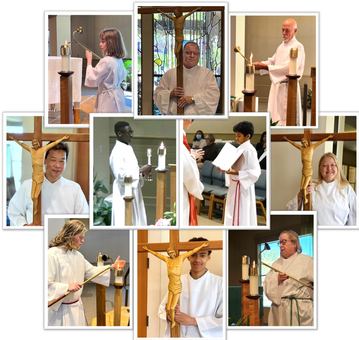
Altar Servers of St. John the Baptist (see related story on Page 3)

The Kingdom of Heaven is like the yeast a woman used in making bread. Even though she put only a little yeast, it permeated every part of the dough. (Matthew 13:33)