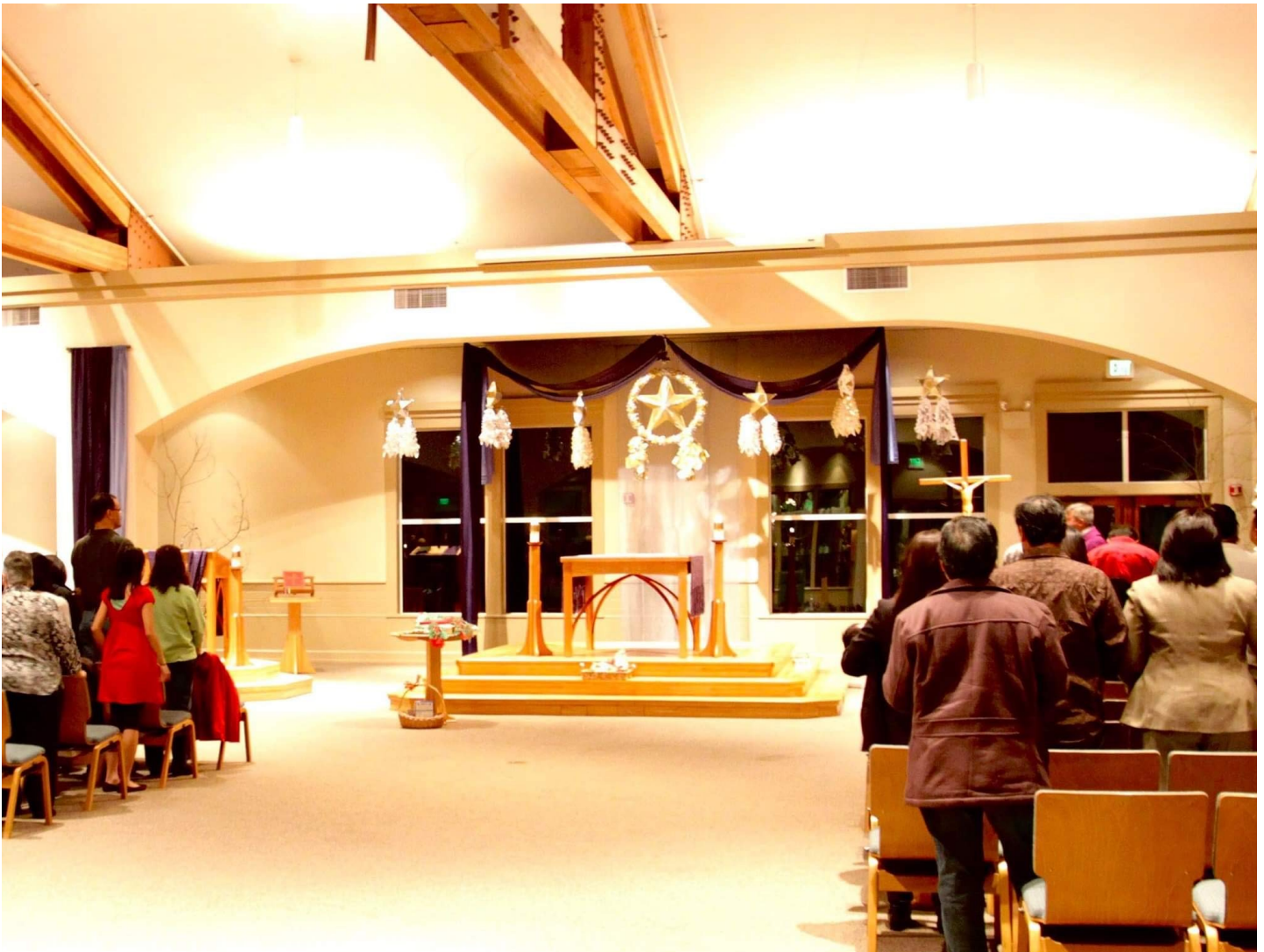
circa 2016

December 11, 2022 Third Sunday of Advent Matthew 17:9a, 10-13