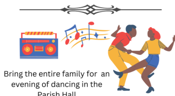
Bring the entire family for an evening of dancing in the Parish Hall

We will be kicking off our annual Thanksgiving Drive in November to provide holiday meals to hundreds of local families. Each meal contains enough food to feed four to six people. Meals are distributed to families through Catholic Community Services, Children's Home Society, Joint Base Lewis-McChord, Kent School District, Kent Youth & Family Services, and St. Vincent de Paul. Please visit our website, Facebook page, and future bulletins for ways to support this cause.