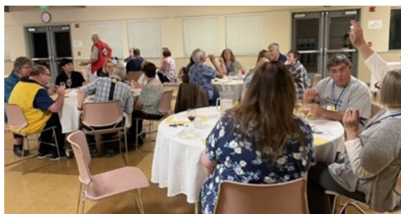
Parishioners, whose Top 5 Strengths include "Achiever," enjoy a Wine & Cheese gathering hosted by the Stewardship & Evangelization Commission on October 8.